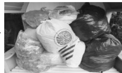
Coffee waste awaiting collection by Point2Point