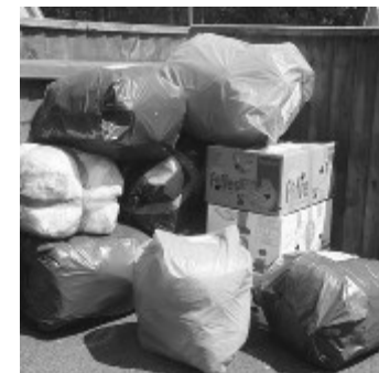
Off to Terracycle